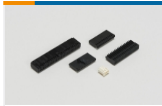
Wire-to-Board Connector Assemblies & Housings(139)